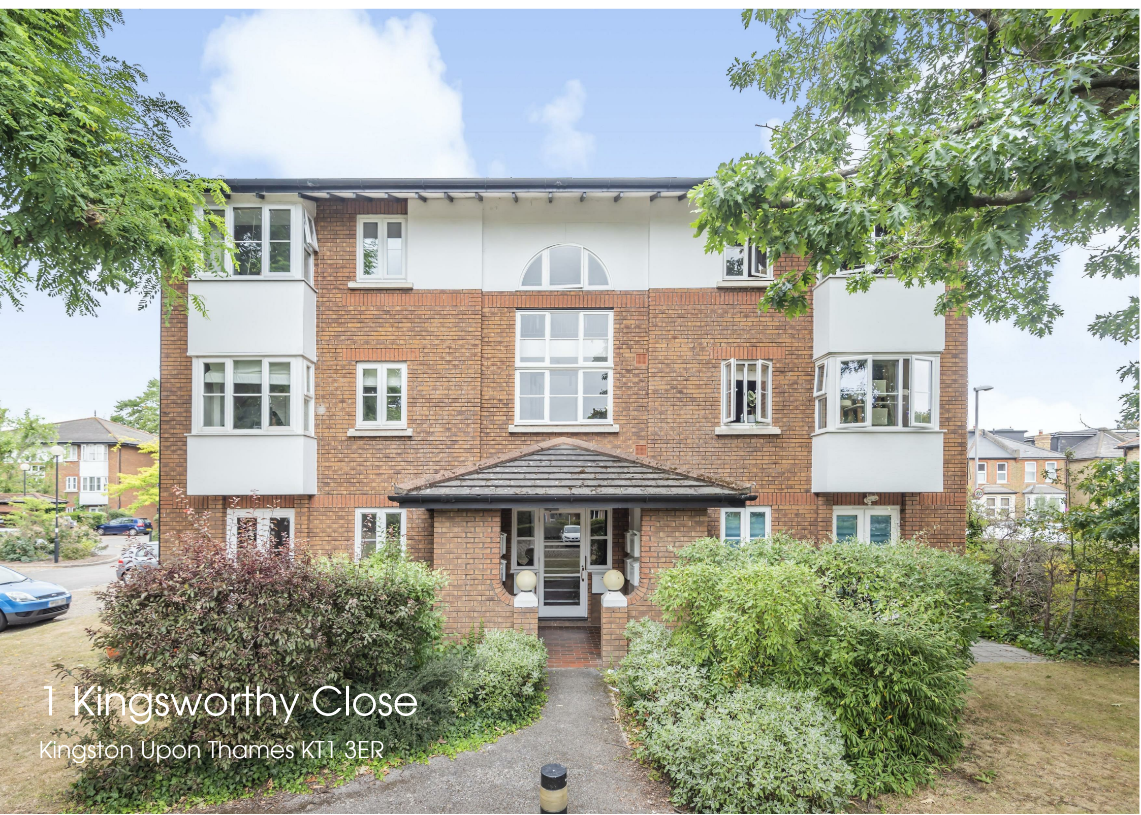
1 Kingsworthy Close Kingston Upon Thames KT1 3ER